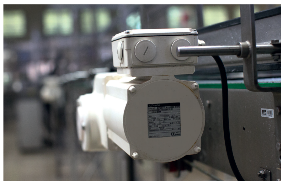
VLT® drives control the speed of the bottling line conveyors, both decentrally ....

The DrivePro<sup>®</sup> Services program offered in Brazil ensures the maximum productivity level of the bottling lines in the Coca-Cola FEMSA factory in Maringá, Paraná.