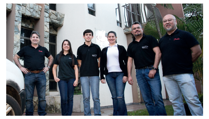
EPS Service delivers Danfoss DrivePro® services to the Maringá factory