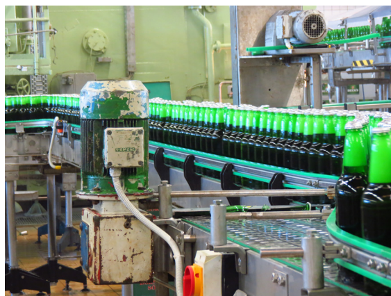
Old bevel gear motor