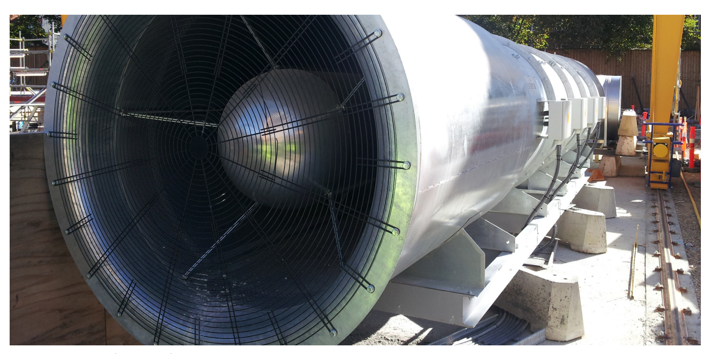
Systemair 4 x 75 kW four-phase fan.

"The equipment in use," states Valente, "is for the excavation phase with the TBM, the mechanical mole. As soon as the spaces between the future stations had been opened, 117 induction fans in the Systemair series IV with low-profile configuration were installed"