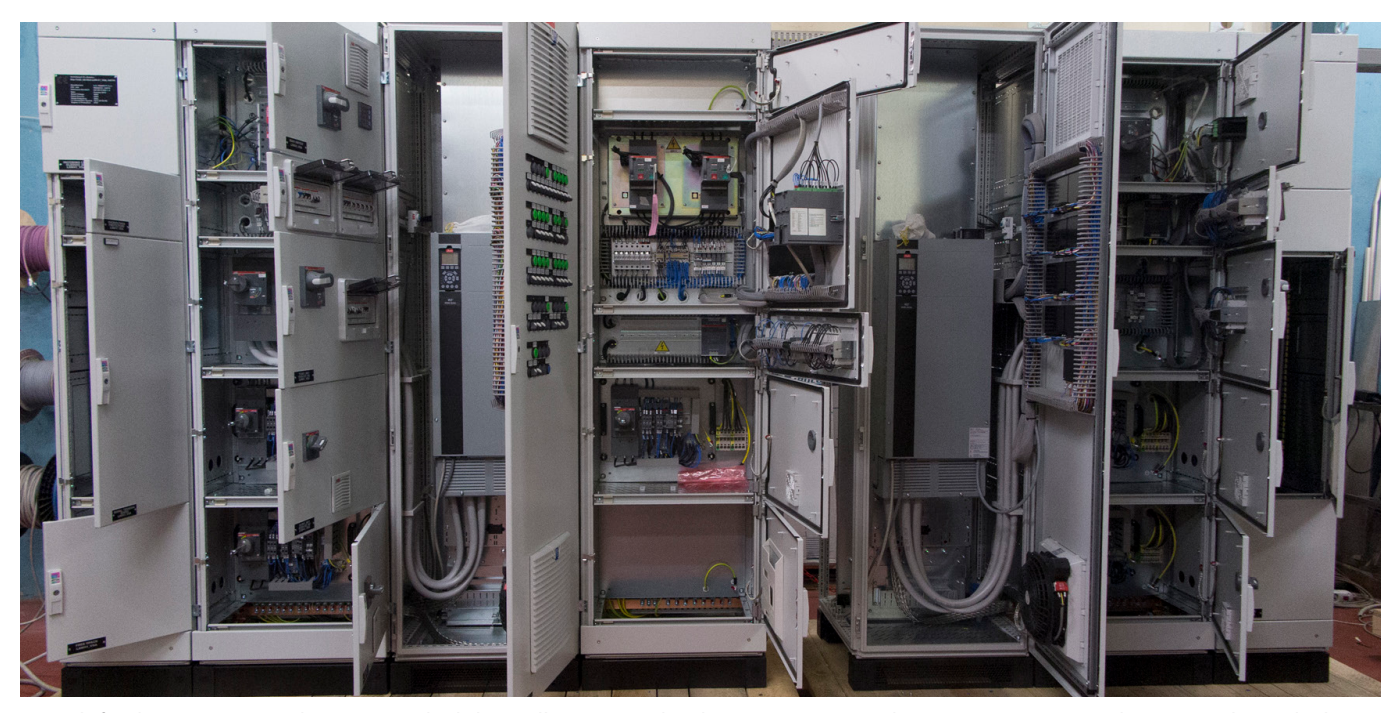
Panels for the station named "FBA" in Frederiksberg Allé, just tested in the H.S. Progetti Production Department and waiting to be packed.

Italian excellence for the new Copenhagen underground line. CMT, Copenhagen Metro Team, is the Italian consortium led by the Salini-Impregilo Group, tasked with constructing Copenhagen's new ring-shaped underground line. The excavation of the two planned tunnels, one for each direction of travel, was carried out with four tunnel boring machines (TBM), which made their way below the surface of Copenhagen. With the inauguration of the new line, 85% of the population will have at least one station at a distance of no more than 600 meters. from their doorstep.