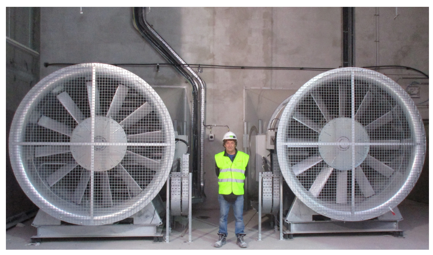
N.2 Reversible axial fans model AXR 2000-12, certified for operation at 250 °C for two hours in the event of fire and equipped with 250 kW three-phase electric motors.

"Due to concerns related to safety and redundancy," states Valente, "the EVS fans are installed in pairs inside the various stations." Each of them is equipped with an electrical control panel and operated by drives from Danfoss.