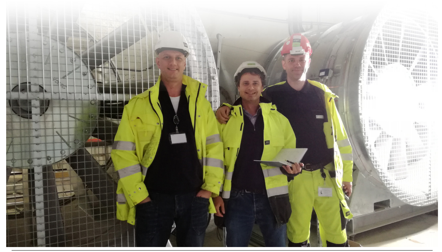
Danfoss can accept no responsibility for possible errors in catalogues, brochures and other printed material. Danfoss reserves the right to alter its products without notice. This also applies to products already on order provided that such alterations can be made without subsequential changes being necessary in specifications already agreed. All trademarks in this material are property of the respective companies. Danfoss and the Danfoss logotype are trademarks of Danfoss A/S. All rights reserved.

H.S. Progetti Srl, based in Ferriera di Buttigliera Alta (Turin), is specialized in the design and construction of special automatic machines for production, construction of control and test benches, supply and development of software for PLC, supervision software and service.