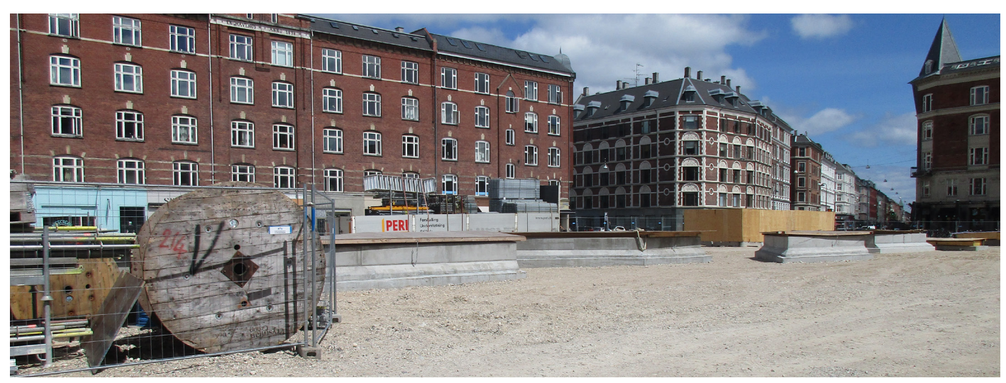
Copenhagen, work in progress