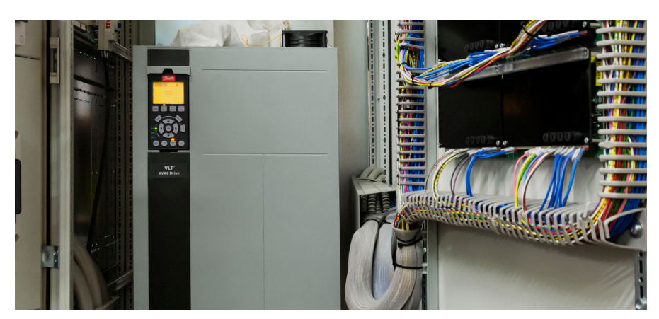
Danfoss Drives VLT® FC102 250 kW drive mounted inside its cubicle.

"Tight spaces are a challenge," observes Leone , "and so was the request for the production of electrical control panels with type 4a segregation. Each functional element inside the panel must be separate from the others."