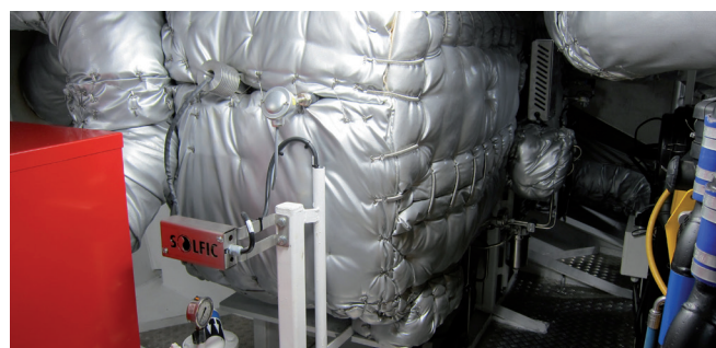
There are two 133 kW JohnDeere/Stamford generators in each engine room, four in total. The 2 engine rooms are located one at each end of the ship. The Solfic SCR exhaust gas filter removes toxic gases and particles.