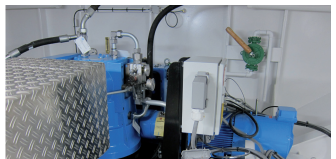
The ZF azimuth thruster (blue) is powered by an Oswald high-efficiency PM motor (green). Azimuth thrusters are often used in small ferries due to the good manoeuvrability they provide.