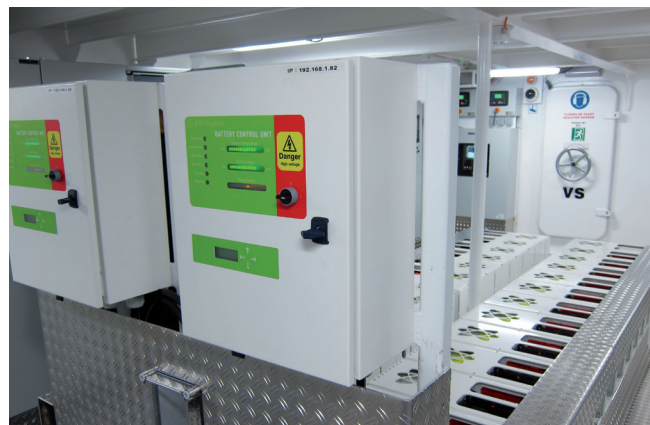
The 2 x 68 kWh Li-Ion EST-Floattech Battery system with battery management system.