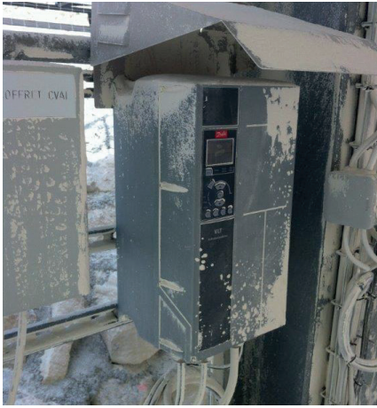
VLT® AutomationDrive operates reliably in harsh conditions.