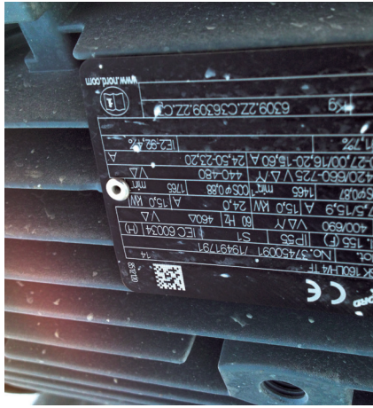
Danfoss AC drives are independent of motor technology.