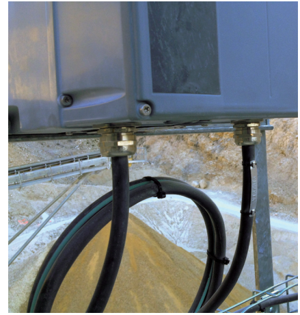
Built-in fieldbus options simplify cabling.