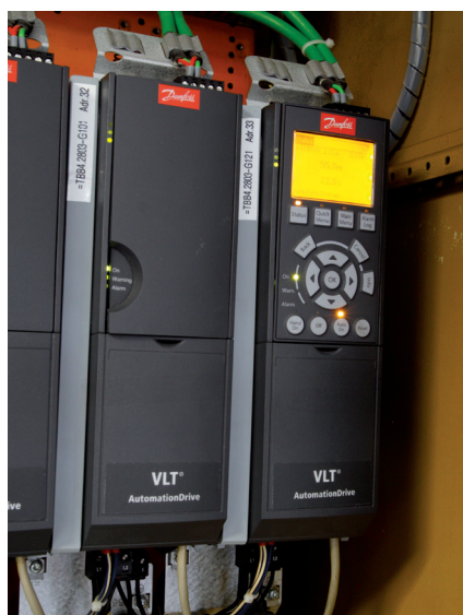
The control panel with display can be attached and detached during operation. This makes it easy to check or change