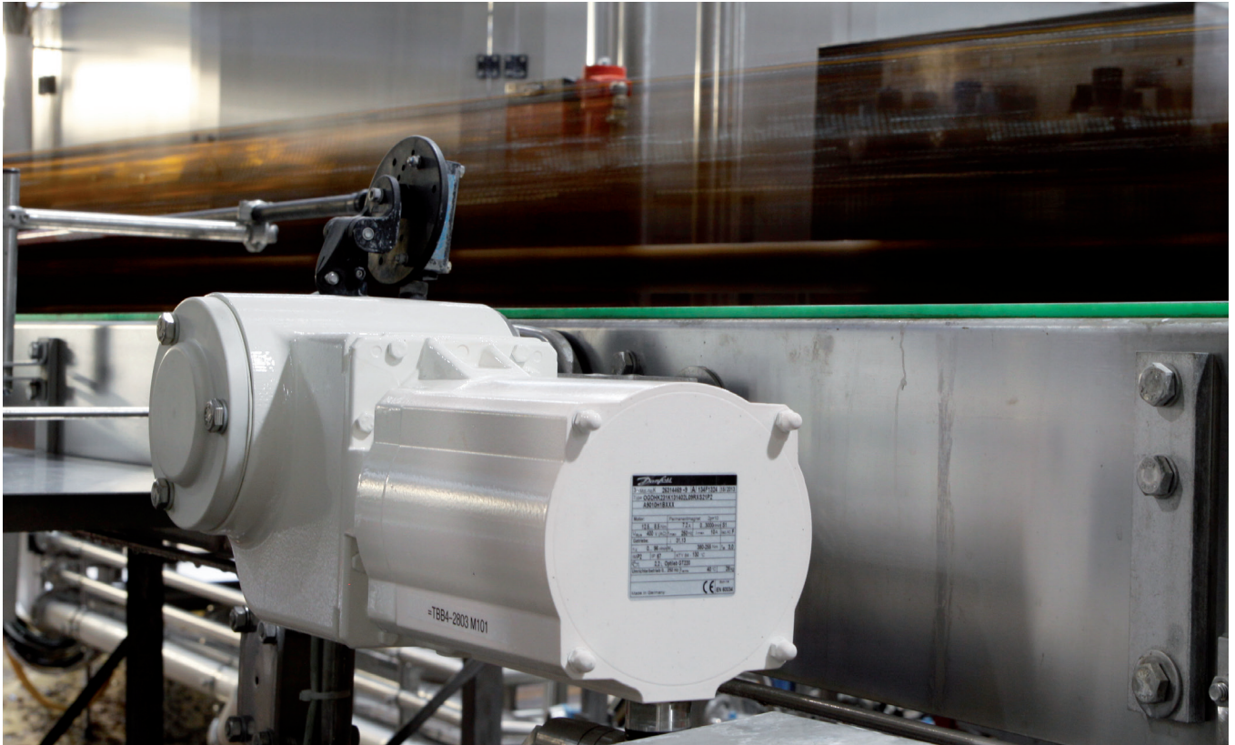
The smooth surface of the VLT® OneGearDrive® is easy to clean and meets the stringent requirements of the beverage industry.

Stiegl has been brewing high-quality beer since 1492. The success story began with a small restaurant and brewery in the heart of the city of Salzburg. Even setbacks such as the devastating fire of 1875 that destroyed the brewery, or the aftermath of WWI and WWII, could not prevent its rise to become the leading private brewery in Austria. One fact, however, has remained the same all along: Stiegl continues to be family-owned today. The combination of state-of-the-art technology and traditional brewing techniques plays an important role in this privately held company. In this spirit, its brewing experts upgraded the old drives of the filling plant to ensure that Stiegl Brewery will continue to deliver first-rate beer to its customers into the future.