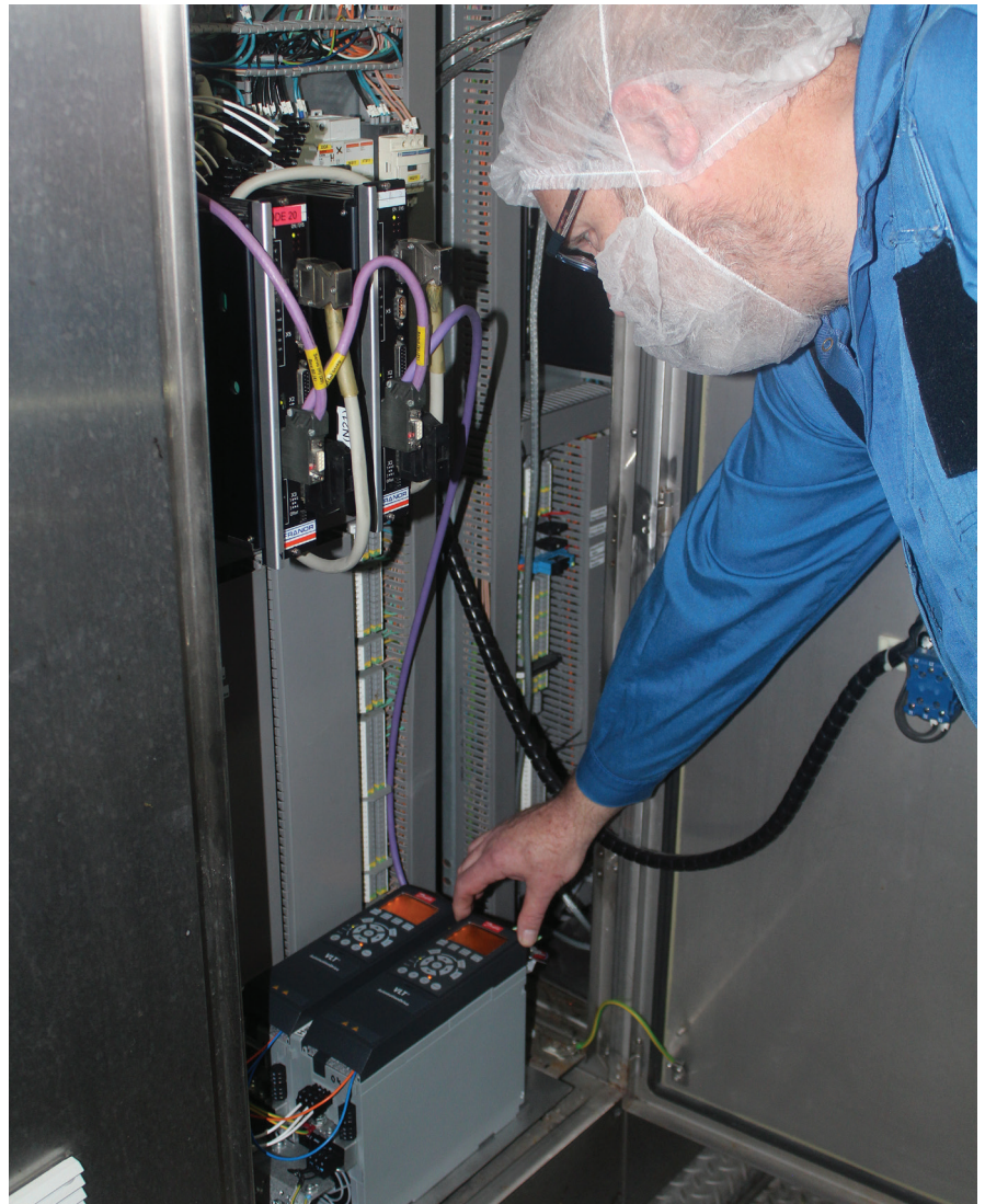
The VLT® AutomationDrive with Integrated Motion Controller provides significant cost and time savings at Danish Crown.