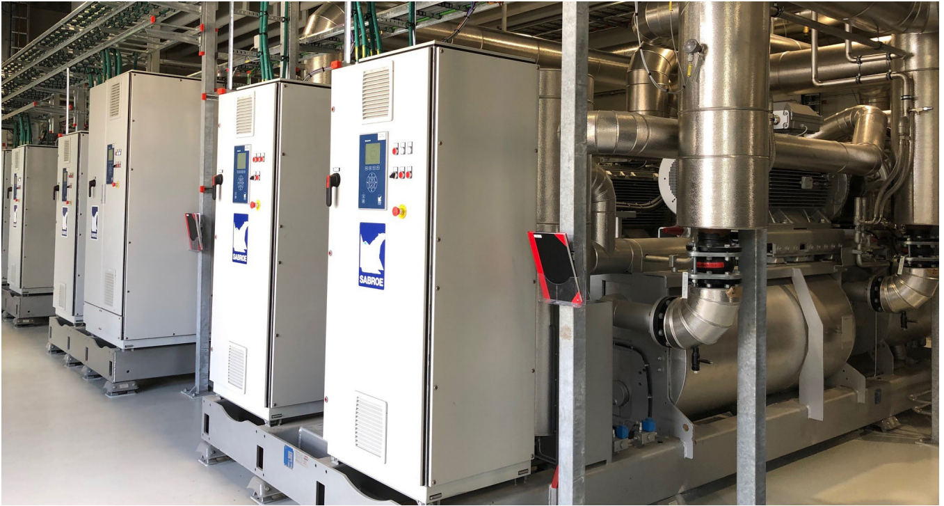
The variable speed controlled Sabroe® heat pumps supplied by Johnson Controls

building owners, Taarnby Public Utility and the heat transmission company CTR. Cooperation between these stakeholders and a mutual ambition to seek out an environmentally friendly and cost-effective solution has been key to the development and implementation of the Taarnby facility.