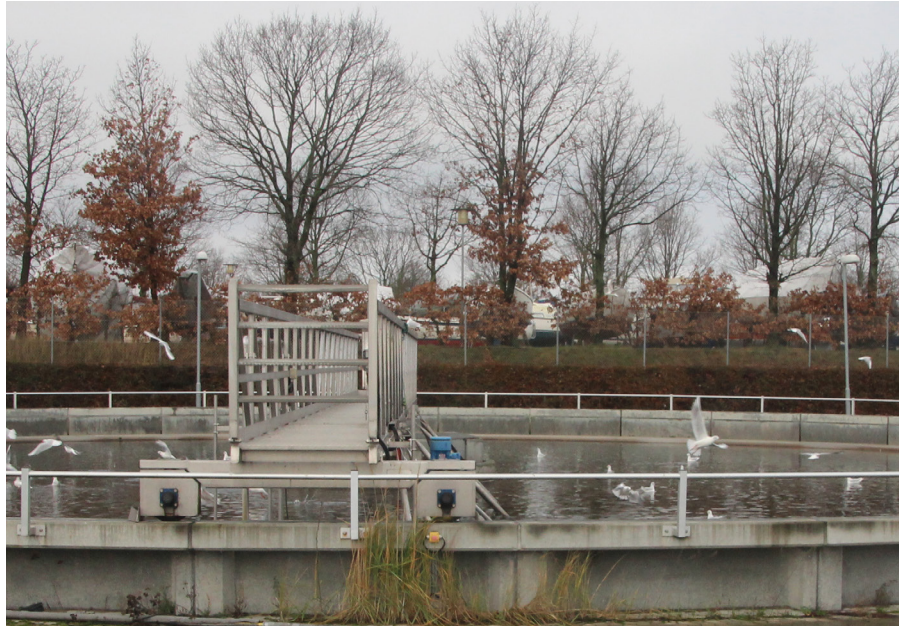
The Taarnby district energy plant is located in the outskirts of the Taarnby waste water treatment plant

The new Taarnby facility is located in an area close to Copenhagen Airport and has been operative since