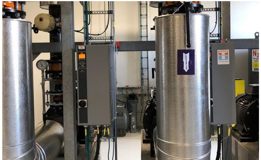
The entire plant is powered by 27 Danfoss VLT® drives in the range from 0.75 to 400 kW.

With the new Taarnby district cooling facility, the ambition is not only to deliver an environmentally friendly cooling alternative to private roof-top chillers, but also a more economical solution. Combining the production of district heating and district cooling in one and the same facility was one step. But placing the energy plant and