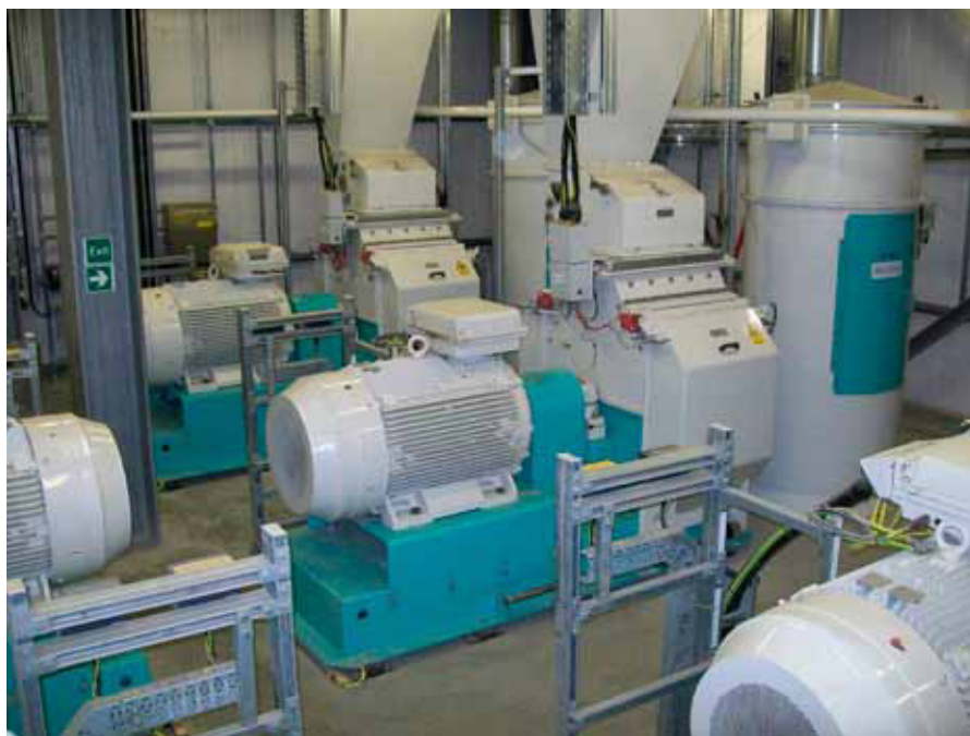
Hammer Mills powered by VLT® High Power Drives.

Danfoss VLT® AutomationDrives for this project include integrated Profibus DPV1 for communication with the Emerson DCS control system, SIL2 Safe Stop technology avoiding the need for costly & bulky contactors; and ATEX approved thermistor supervision simplifying the protection of Ex rated motors in hazardous areas.