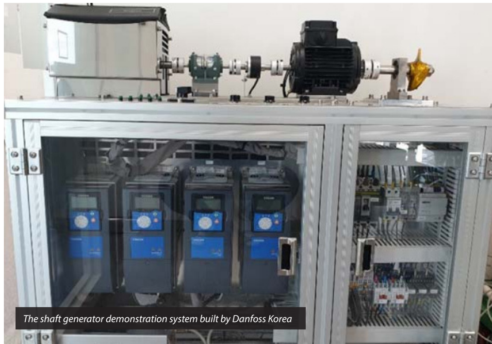
The shaft generator demonstration system built by Danfoss Korea

Since the shaft generator is classified as a generator onboard the ship, the conditions required for the general generator were applied.