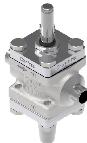
ICF 20-2-121L with ICFE module Replacing EVRA(T) 10

For more information, please visit Danfoss Product Store