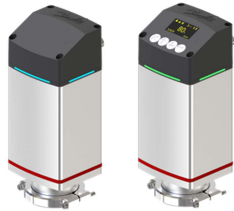
New generation ICAD B

To meet all needs, the ICAD B is available in a series of four variants: RS485 with display, Ethernet with display, RS485 w/o display, and Ethernet w/o display.