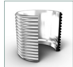
Flexible two-in-one connection