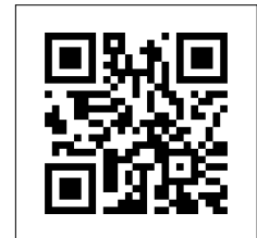
Scan QR code for more technical information and code numbers