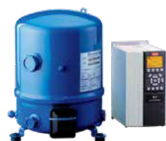
VTZ 086-G & Compressor Drive 7.5 kW