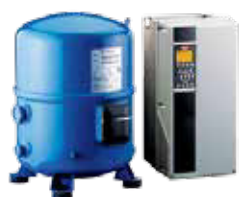
VTZ 242-G & Compressor Drive 22.0 kW