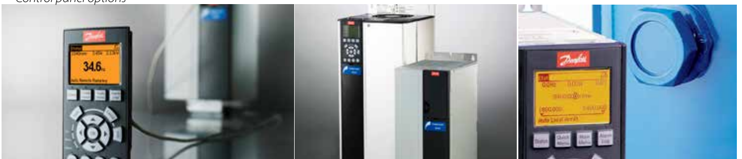
Control panel options

provided by the speed reduction at night and the limited number of starts and stops.