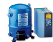
VTZ 038-G & Compressor Drive 4.0 kW