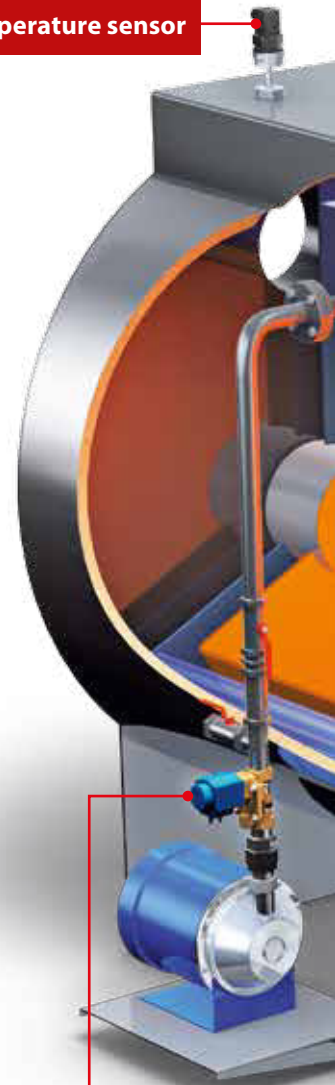
EV220B solenoid valve