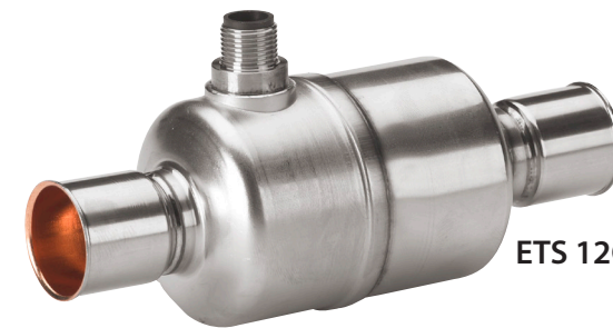
ETS 12C – ETS 24C

Today, ETS Colibri® is a result of our dedication and passion for engineering, built around uncompromised quality and performance. Its focus on energy efficiency ensues from placing great attention to our customers' needs.