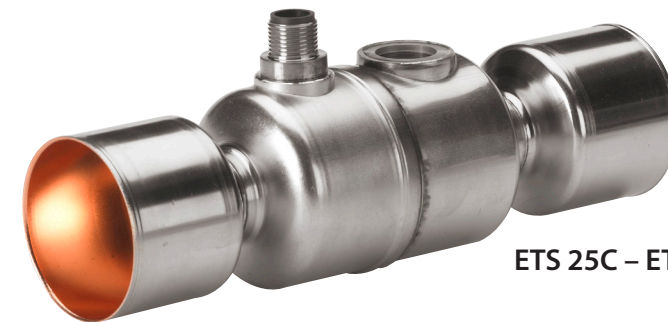
ETS 25C – ETS 50C – ETS 100C