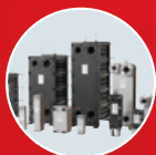
PLATE HEAT EXCHANGERS

Substations are house heating systems that handle the heat transfer from the District Heating pipes into a building in order for the end-users to get hot water and heat on demand.